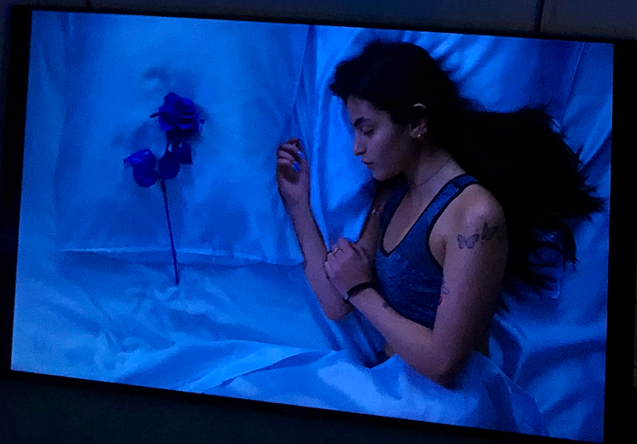
3 channels installation for Utopi.es Art Prize - Magasins Généraux in Paris, May 2022